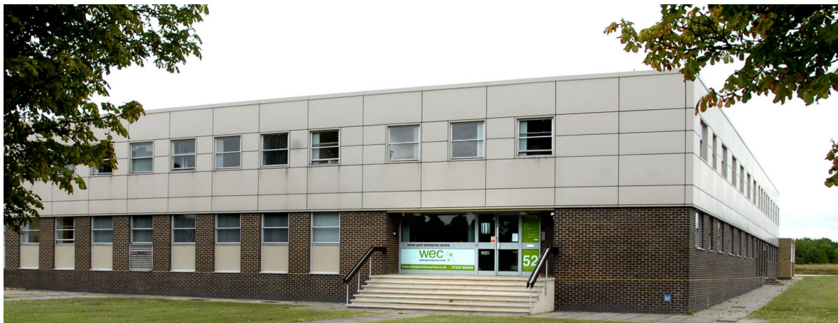
Wrest Park Enterprise Centre – Building 52 – our entrance at rear of building