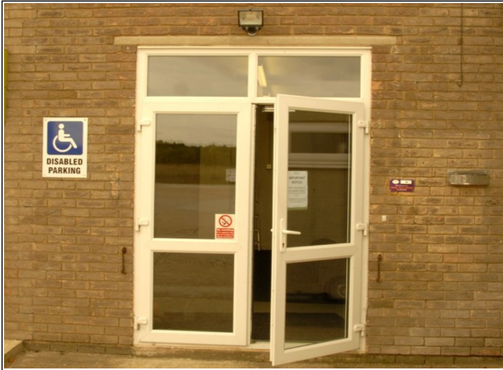
Disabled Parking and Entrance to Healing Centre at rear of building

Please ring door bell – right hand side of door.