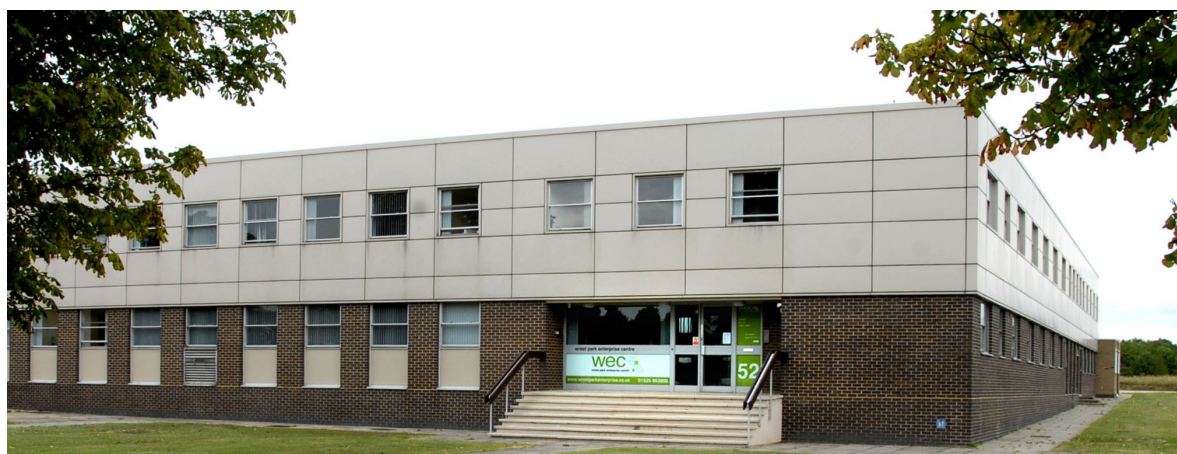
Wrest Park Enterprise Centre – Building 52 – our entrance at rear of building